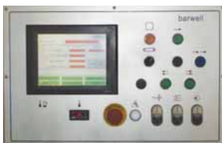
ECO+ Touch Screen