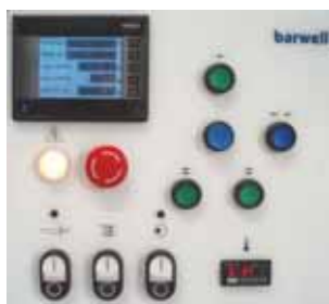
ECO Touch Screen